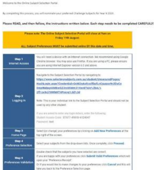
Example of email to be sent to students.