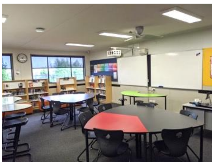
Year 9 Occhiena Centre

The Year 9 2025 Team will be confirmed later this year.