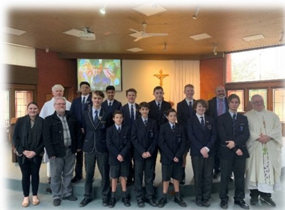
Mass at St Joseph's, Boronia